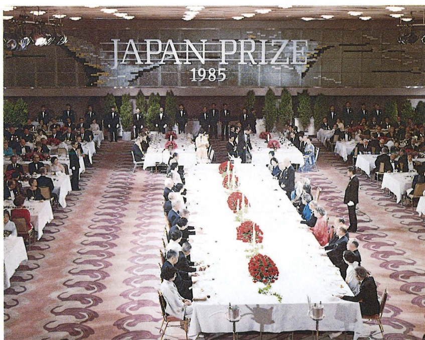
The Japan Prize Banquet was held at the New Otani Hotel (Tsuru Room), Tokyo