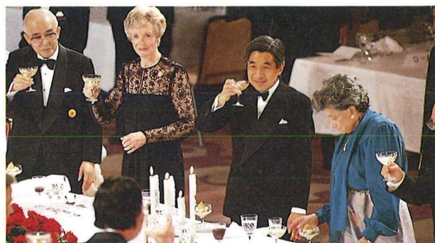
H.I.H. Crown Prince Akihito led the toast at the Banquet held at the New Otani Hotel, Tokyo