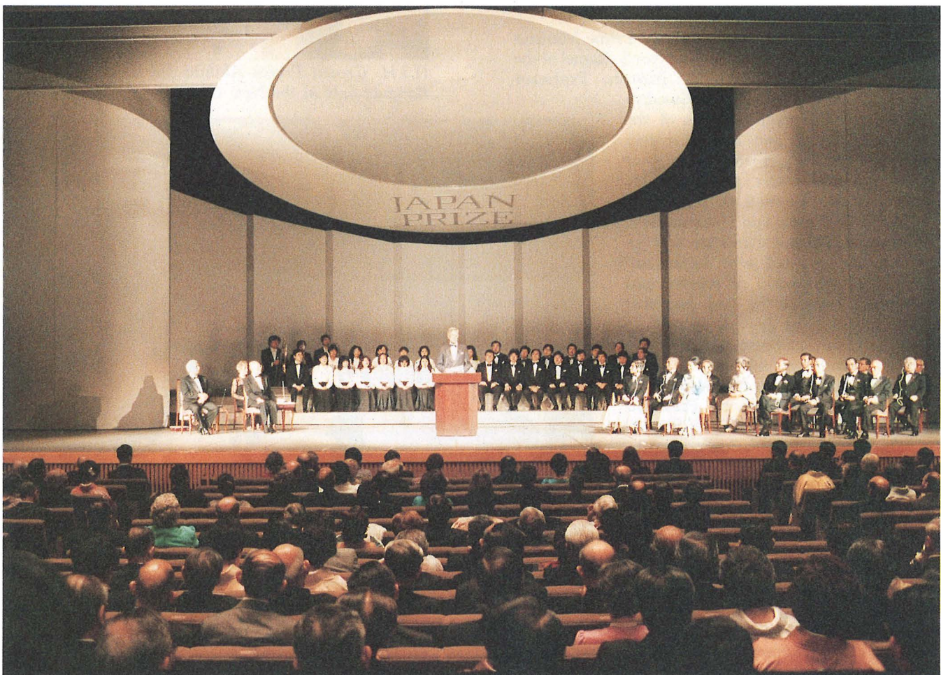
The First Japan Prize Awarding Ceremony was held at the National Theater, Tokyo.