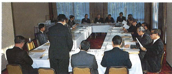
The First Japan Prize Examination Committee convened in Tokyo.