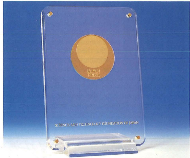
The Commemorative Medal designed by Yusaku Kamekura

February, this year, and the selection of two nominees were confirmed.