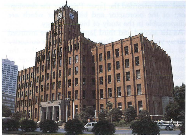
Shisei Kaikan, where the Main Office of the Foundation is located.

Konosuke Matsushita, executive adviser of Matsushita Electric Industrial Co., Ltd., is president of