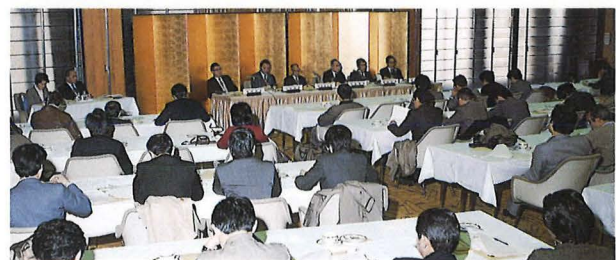
The names of the two laureates are announced at the press conference.