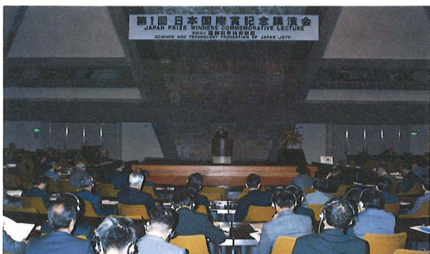
A Commemorative Lecture Meeting was held in Kyoto.

Dr. Katchalski spoke on the present and future prospects of enzyme fixation technology and enzyme reaction device and emphasized the need for inter-