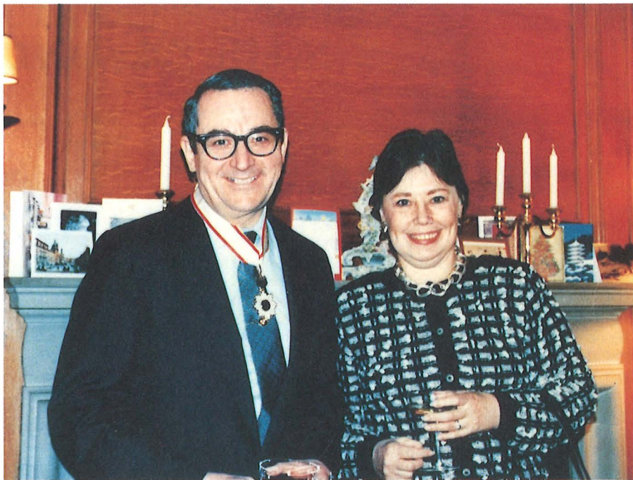
Dr. and Mrs. Elias J. Corey