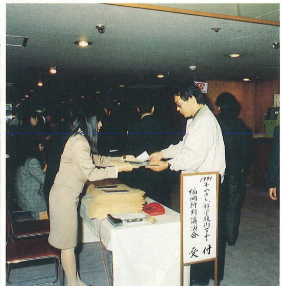
Scenes at the Fukuoka City special seminar (upper and left)