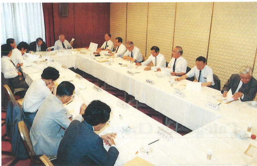
A 1993 Fields Selection Committee meeting

However, our selected category is based on a new concept and view and we hope a breakthrough which has actually been proved to contribute to the diagnosis and treatment of diseases will be selected.