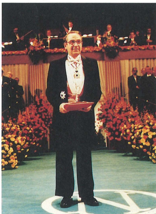
Dr. Corey received the 1990 Nobel Prize in Chemistry wearing the Order of the Rising Sun, Gold and Silver Star

I am very much looking forward to a return visit to Japan in August 1992 for an International Meeting in Tokyo.