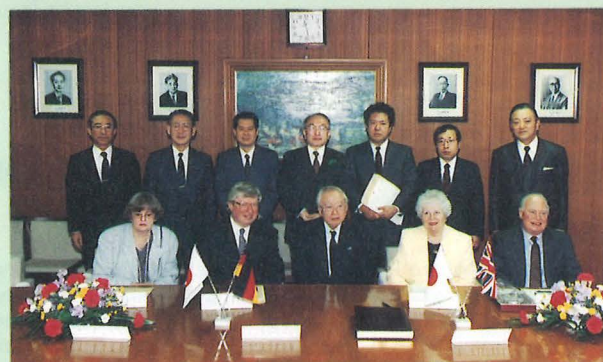
Visit to the Science Council of Japan (April 22)