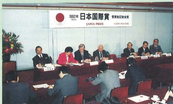
Press conference at the Japan Press Center (April 22)