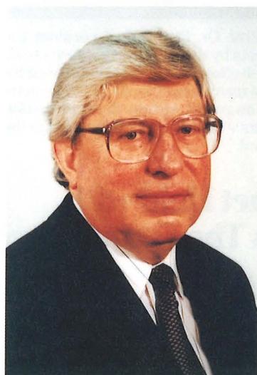
Prof. Dr. Gerhard Ertl

Two Professors from Germany and the United Kingdom were awarded the 1992 (eighth) Japan Prize, the most prestigious and honored prize in the fields of science and technology, at a presentation ceremony held at the National Theatre in Tokyo on April 27.