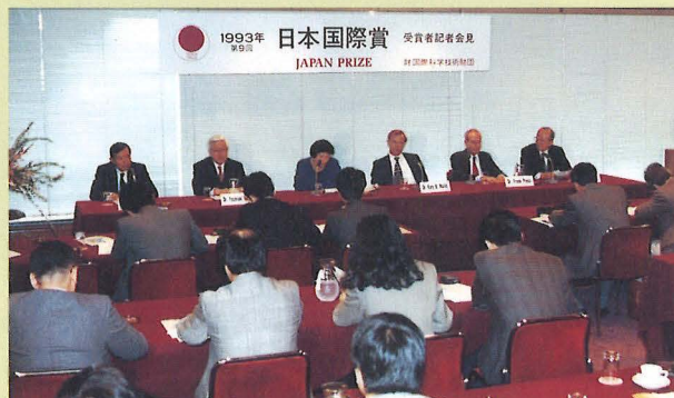
Press Conference at the Japan Press Center (April 30)