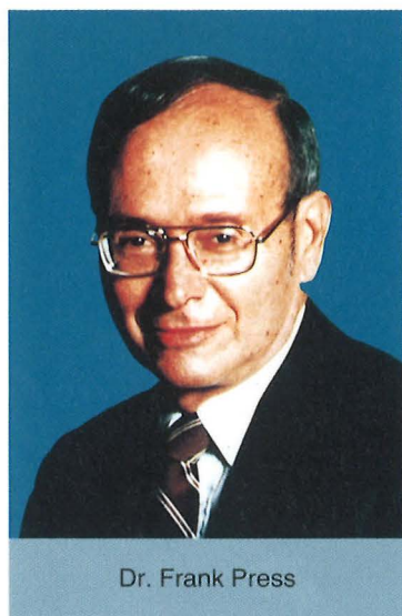
Dr. Frank Press

Two scientists from the U.S. were awarded the 1993 (9th) Japan Prize, the most prestigious and honored prize in the fields of science and technology, at a presentation ceremony held at the National Theatre in Tokyo on April 28, 1993.