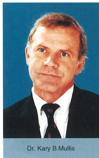
Dr. Kary B. Mullis

In the category of Molecular and Cellular Technology in Medicine, the Prize went to Dr. Kary B. Mullis, Founder and Vice President Research of Atomic Tags, Inc., who is credited for his development of the polymerase chain reaction.