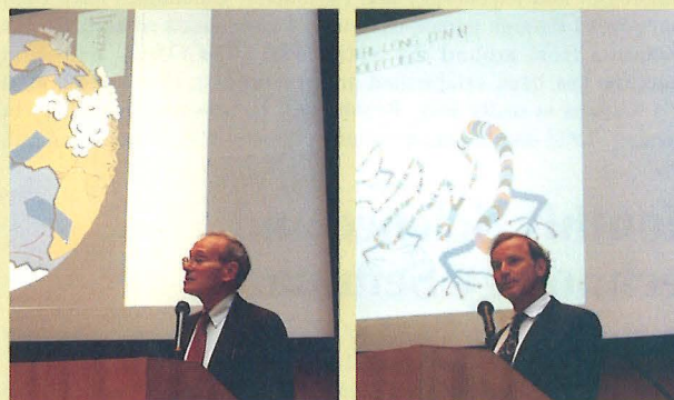
Commemorative Lectures at the Hall in Science Council of Japan (April 30)