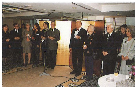
Welcome reception (April 23)