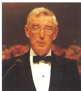
Dr. Bruce N. Ames