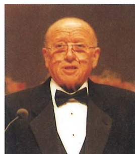
Dr. Joseph F. Engelberger