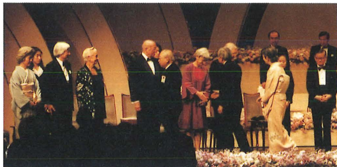
The laureates, honored by Their Majesties The Emperor and Empress