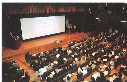
Commemorative lectures (April 24)