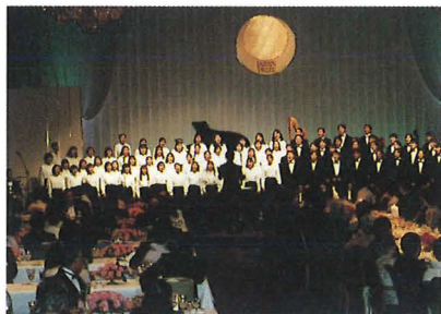
A view of the Banquet