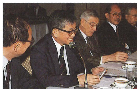
Academic discussion (April 26)