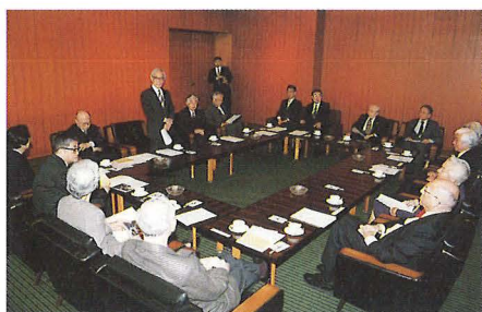
Visit to the Japan Academy (April 24)