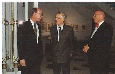
Reception party hosted by the American Embassy (April 24)