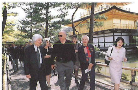
Holiday in Kyoto (April 27)