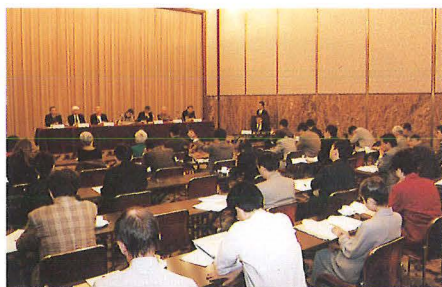
Press conference at the Japan Press Center (April 22)